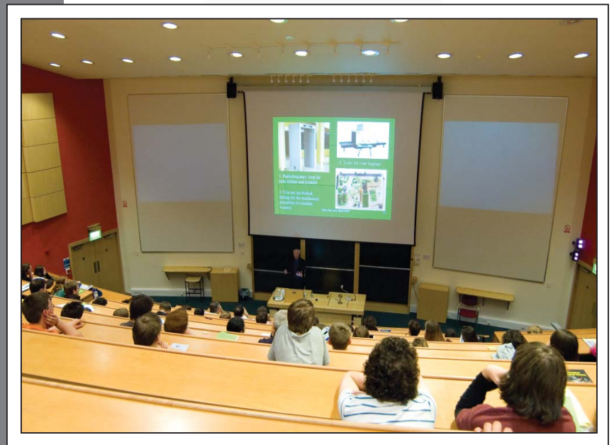
A view of the Martin Wood Lecture Theatre